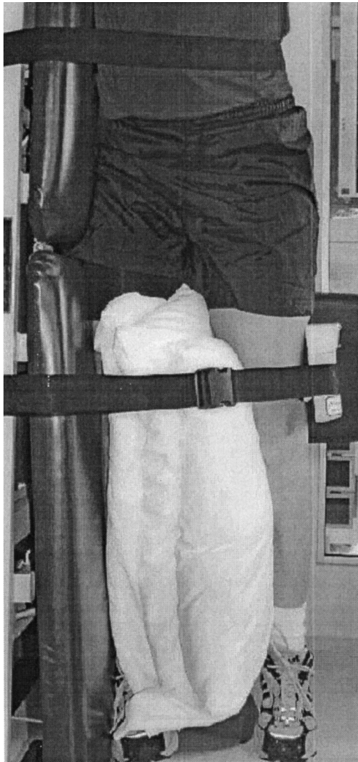
FIGURE 1 —Isometric testing of hip abduction strength using hand-held dynamometry and strap stabilization.

Hip abduction isometric strength testing was performed with subjects positioned in sidelying on a treatment table (Fig. 1). A pillow was placed between the subjects' legs, using additional toweling as needed, such that the hip of the leg to be tested was abducted approximately 10° as measured with respect to a line connecting the anterior superior iliac spines. A strap placed just proximal to the iliac crest and secured firmly around the underside of the table was used to stabilize the subjects' trunk. The center of the force pad of a Nicholas hand-held dynamometer (Lafayette Instruments, Lafayette, IN) was then placed directly over a mark located 5 cm proximal to the lateral knee joint line. This dynamometer uses a load cell force detecting system to measure static force ranging from 0 to 199.9 kg with accuracy to 0.1 kg \pm 2%. The dynamometer was secured between the leg and a second strap that was wrapped around the leg and the underside of the table. The strap eliminated the effect of tester strength on this measure which has been reported to be a limitation of hand-held dynamometry (4). After zeroing the dynamometer, the subject was instructed