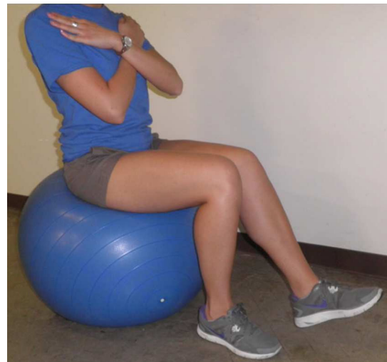
Figure 1. Trunk Stability test: The participant first sits on a Swiss ball with their ankle in a neutral position, their knee flexed to 90 degrees and their hips flexed to 90 degrees. They then cross their arms and lift one foot slightly up and forward. After a practice test with the eyes open the participant closes their eyes and repeats the test. Breaking from this position is recorded as an error if one of the six following deviations was noted: Lifted foot touches the ground, they reach for the table/wall/chair, their planted foot shifts, the arms come uncrossed (but do not touch the table), they rest the lifted knee against the planted leg, or they open their eyes. To assist with the participant regaining stability if they lost balance two solid objects were placed on either side of them within reaching distance, these objects could include chairs, tables or a wall.

The trunk control test was then performed. This test was modeled as a clinical version of the unstable trunk sitting test which has been previously used as a valid and reliable laboratory based test to assess differences in trunk control in patients with a variety of impairments. 26,27 To perform the test the participant was asked to sit on a Swiss ball with both feet planted firmly on the ground. The ankle was placed in a neutral position, the knee in 90 degrees of flexion and the hips in 90 degrees of flexion (Fig. 1). They were also asked to sit straight up and fold their arms. An initial practice trial was performed where they were instructed to keep their eyes open and lift one leg for 30 s, followed by the other leg for 30 s. In order to standardize the position of the